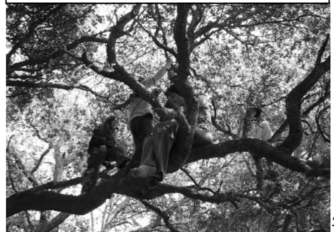
Pictured above/below: participants at Save the Oaks

MCLI suggested that a complaint be filed with the OIG of the Department of Interior on this matter.